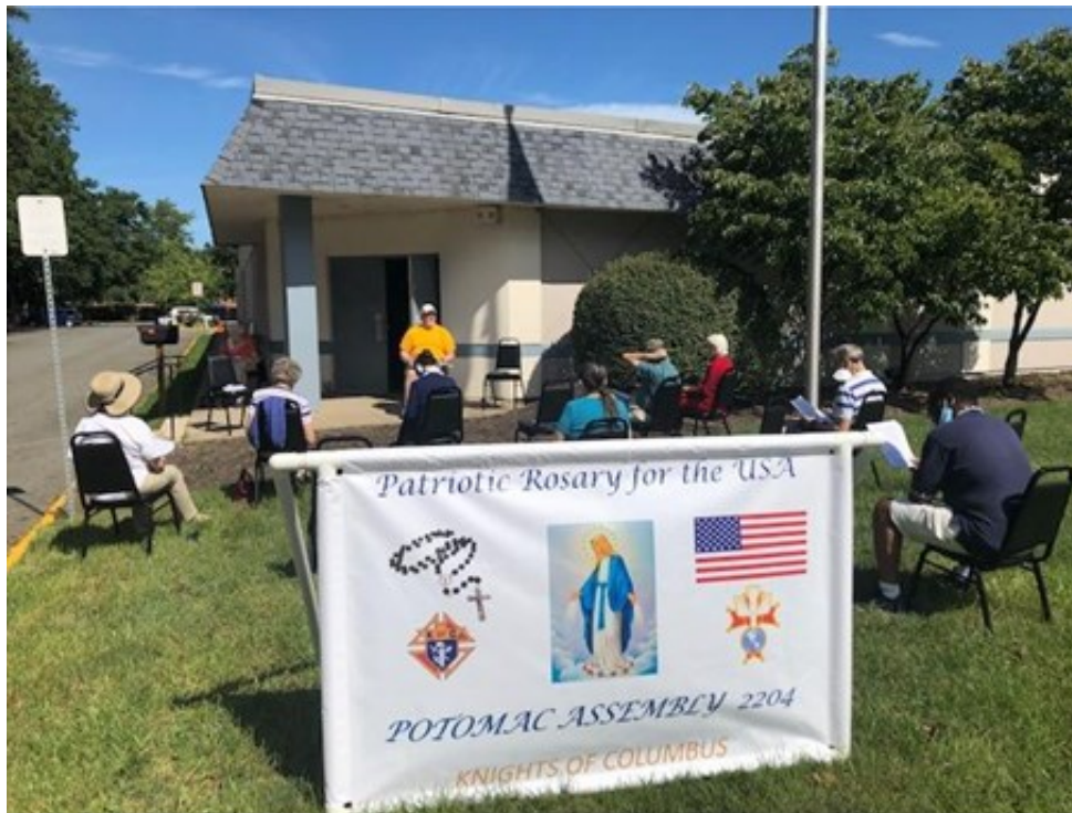
September Patriotic Rosary, see page 7.