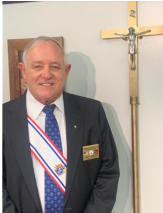
Past Faithful Navigator Dinner, see page 7.