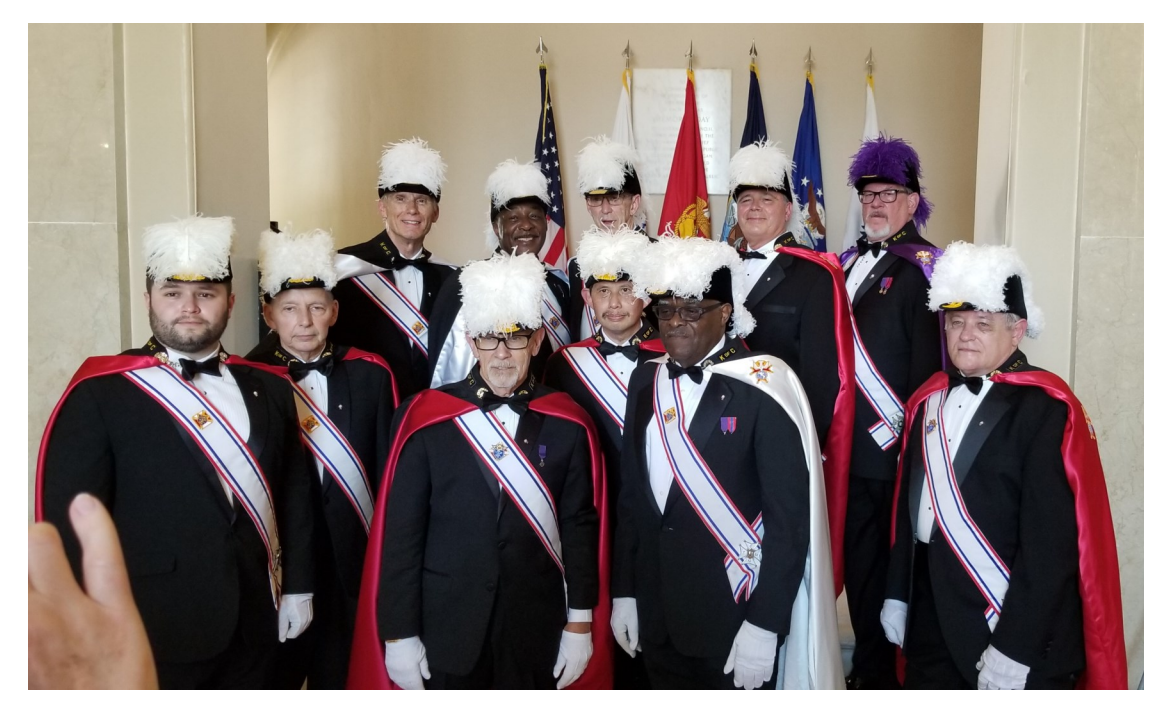
Tomb of Unknown Soldier at Arlington Cemetery from June 29, 2019 see page 7. This picture was taken when the old regalia was allowed, and is no longer used.