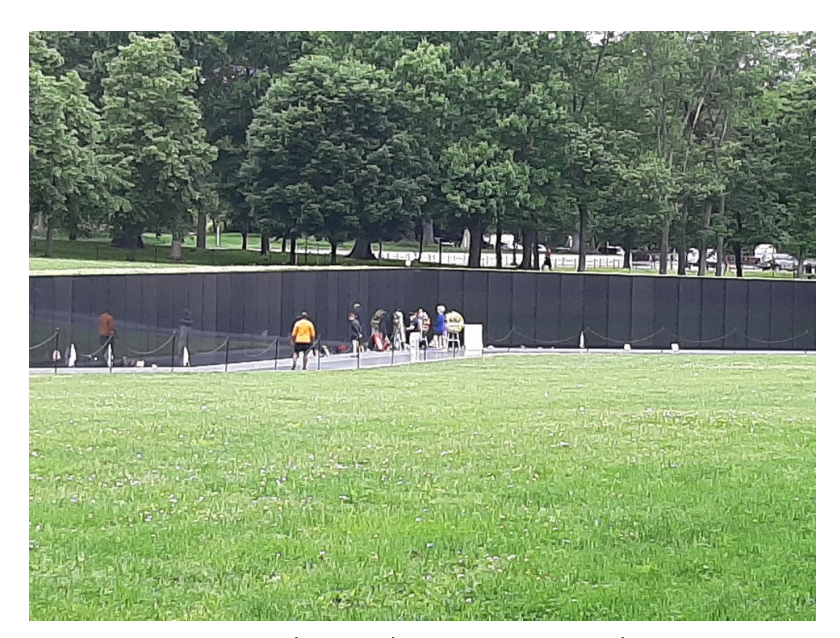
Memorial Day at the Vietnam Memorial

Thank you for the opportunity to serve you!