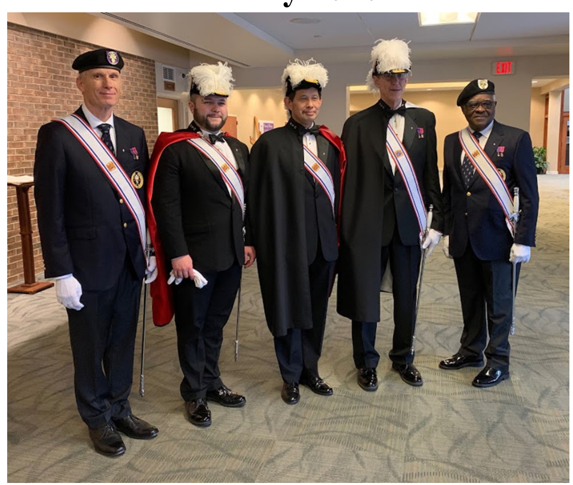
Chalice Ceremony from March 9, 2019 at Good Shepherd, see page 7.

This picture was taken when the old regalia was allowed (center three Sir Knights), and is no longer used. The two outer Sir Knights are wearing the new regalia.