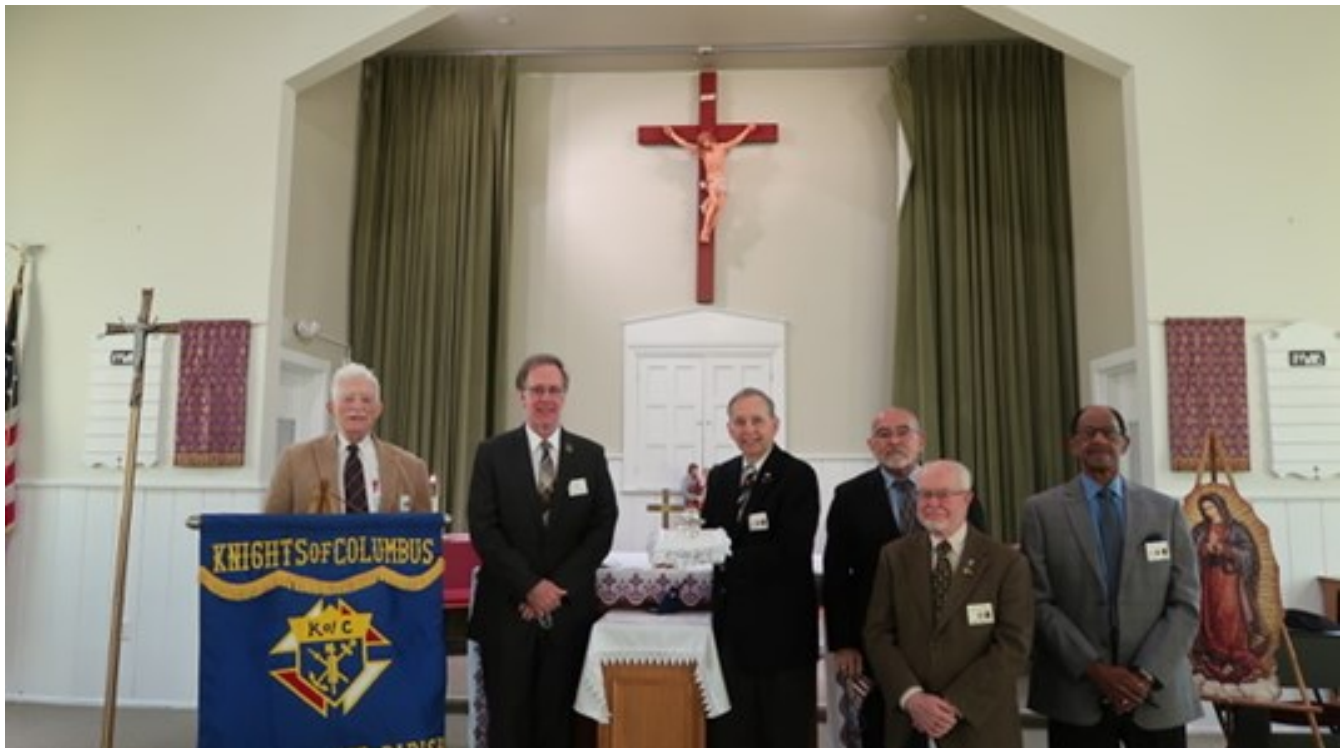
Silver Rose at Fort Belvoir Council, see page 7.