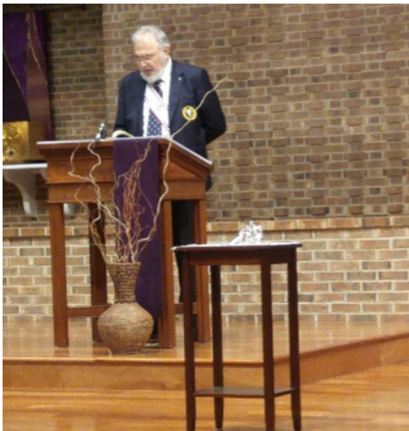
Silver Rose at Good Shepherd Catholic praying the Rosary, see page 7.