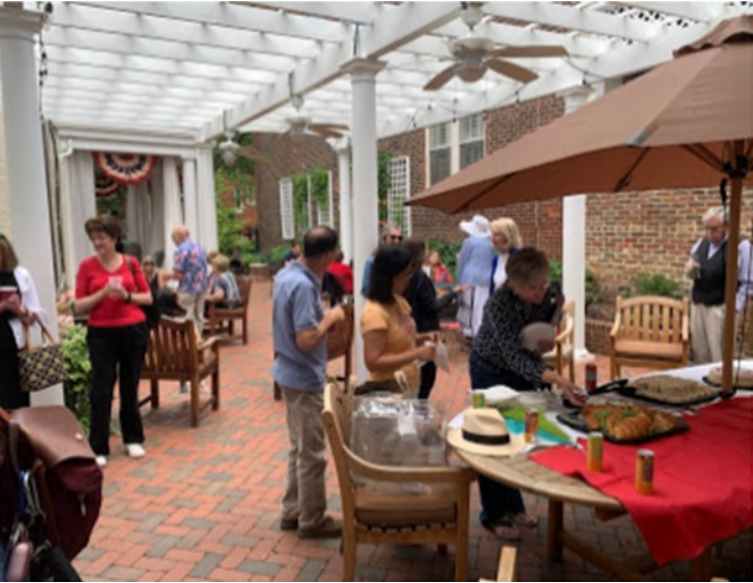
Patriotic Rosary at Basilica of Saint Mary, see pages 7 and 8.