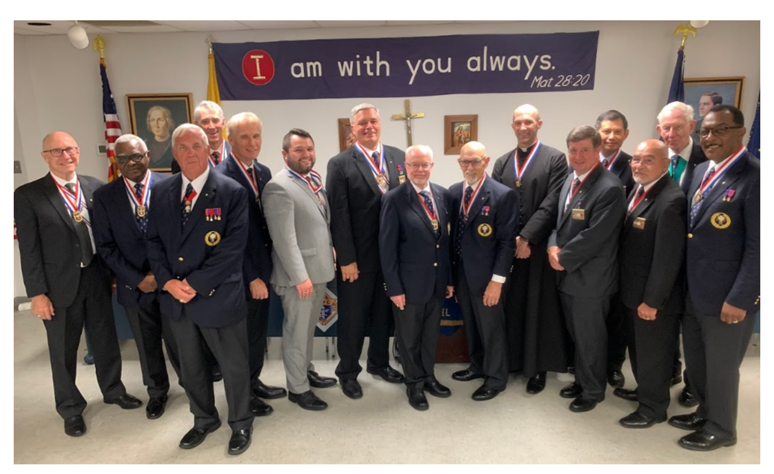
Installation of Officers on July 26, 2021, see pages 7 and 8.