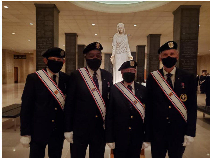
Father Vincent Capodano Memorial Mass, September 7, 2021, see page 7.