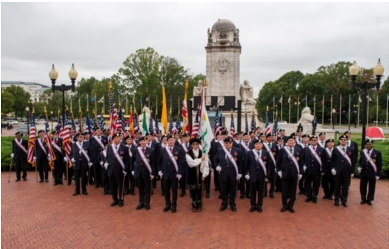
Columbus Plaza, Union Station, Washington, D.C., October 11, 2021, see pages 7-8.