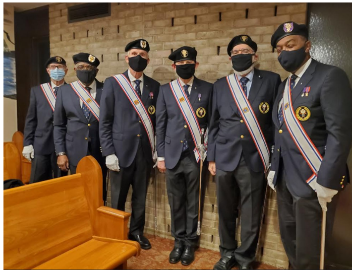
Simbang Gabi Mass at Saint Louis on December 23, 2021, see page 7.