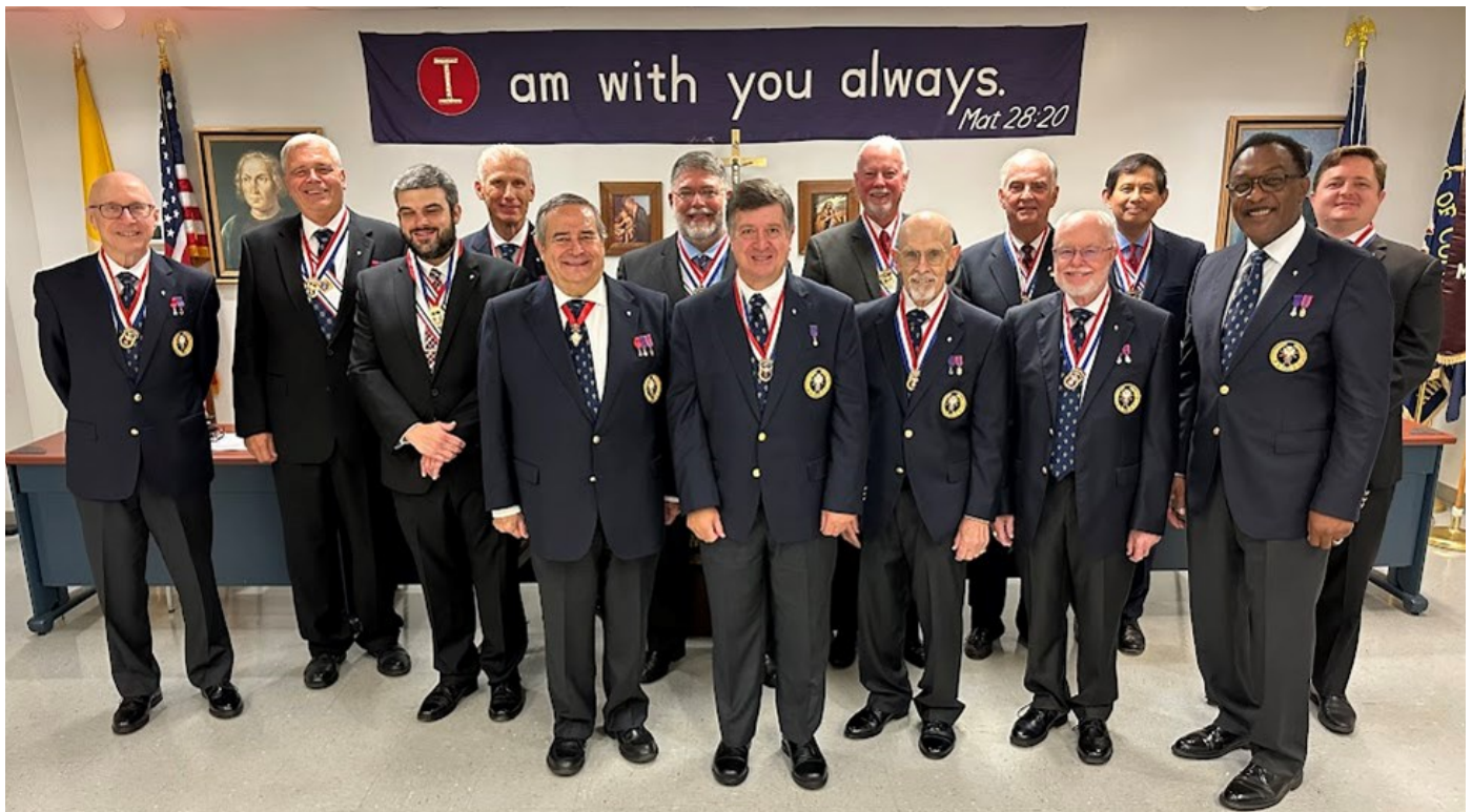
Induction of New Assembly Officers June 26, 2023, see pages 6-8.