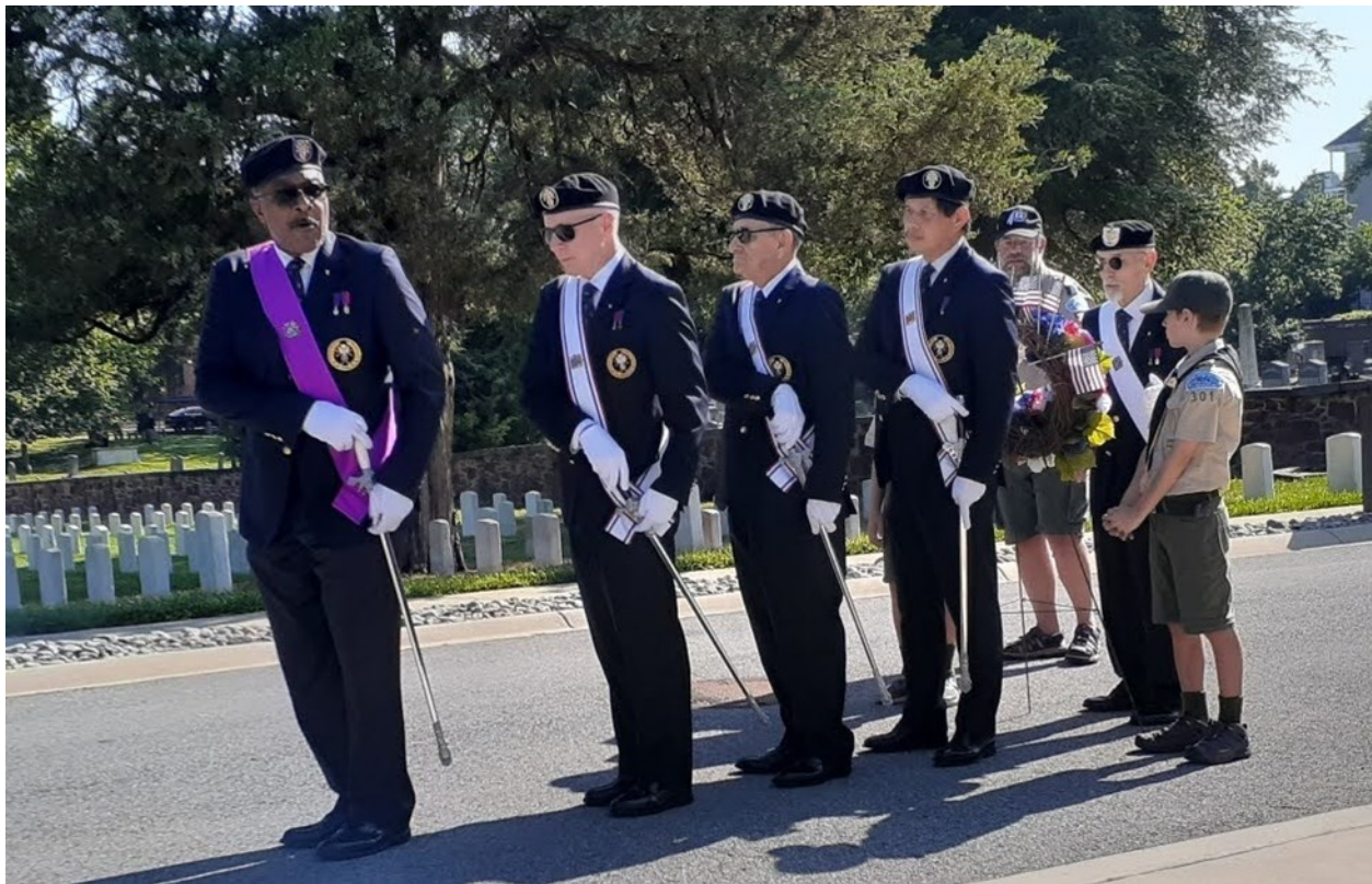
Wreath Laying at Alexandria National Cemetery, July 4, 2023, see pages 6-8.